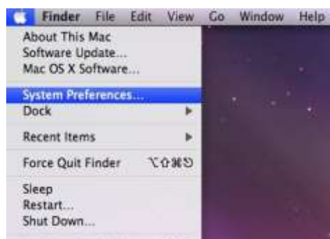
Figure 1, Apple Mac OS X, Apple menu