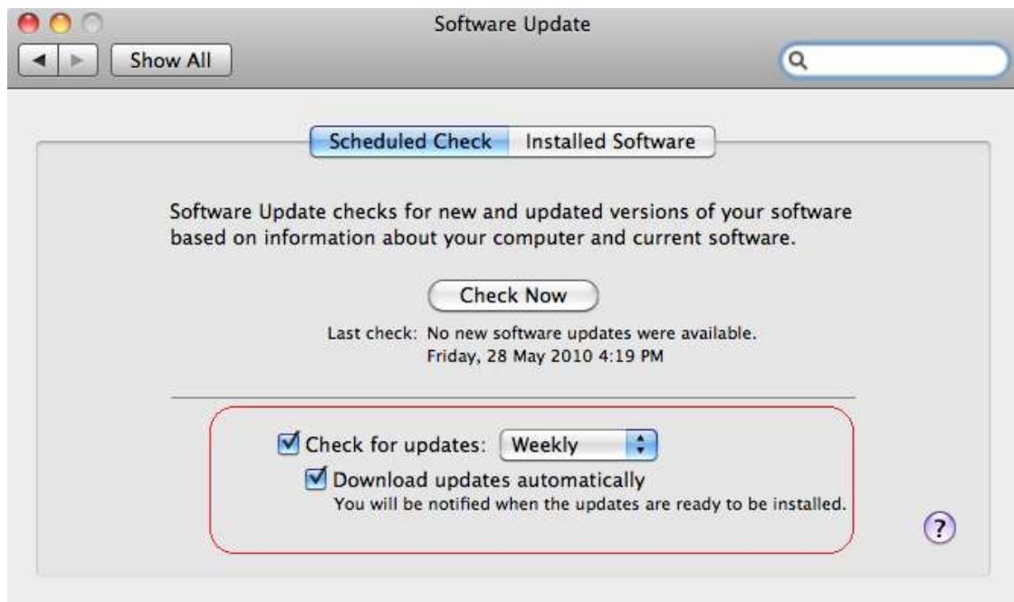
Figure 3, Mac OS X, Software Update pane