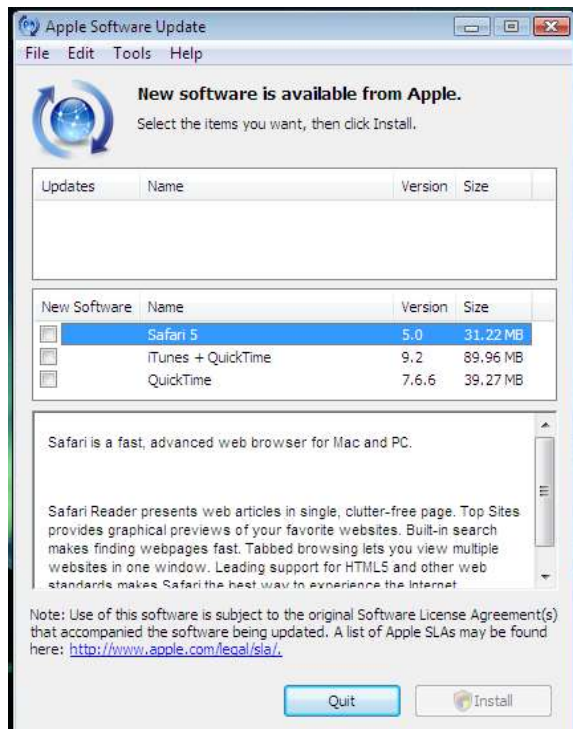
Figure 3, Apple Software Update for Microsoft Windows

The Apple Software Update tool will detect and report if there are: